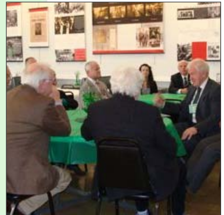
Jimmy Deenihan TD, Minister for Diaspora Affairs speaks to members of the Irish community at the ICHC this past March.

MAY 7, 2015 • ANNUAL ELECTIONS 6:30-7:30 PM MILWAUKEE MONTHLY MEMBERSHIP MEETING 7 PM Irish Cultural and Heritage Center (2133 W. Wisconsin Avenue)