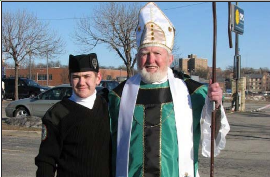
The Shamrock Club's own St. Patrick