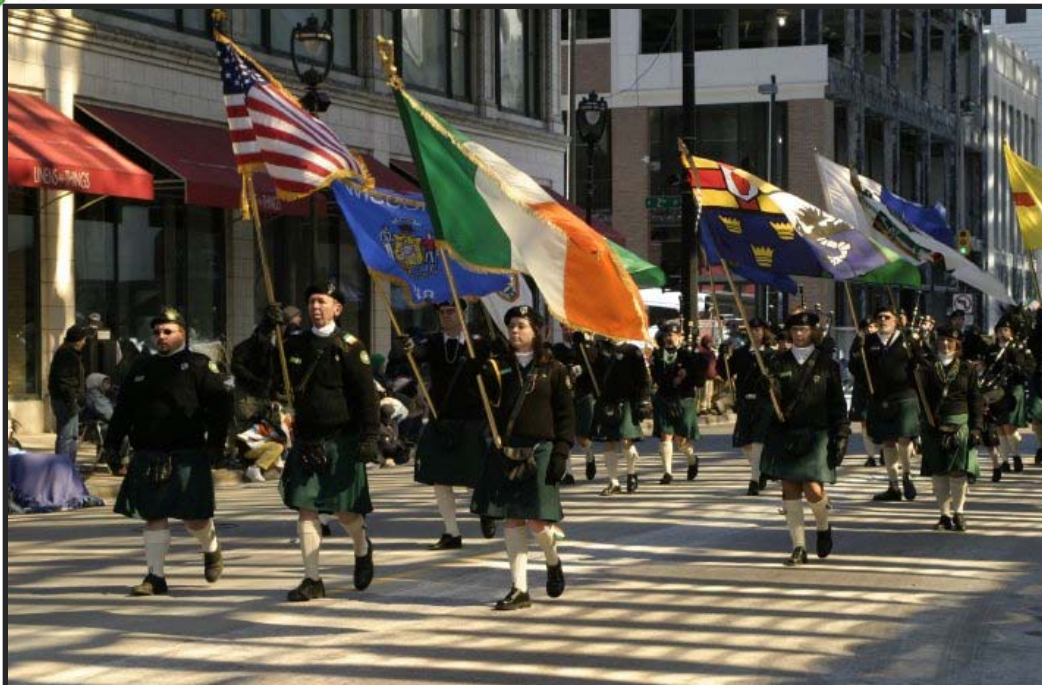
Shamrock Club Color Guard Pipes & Drums