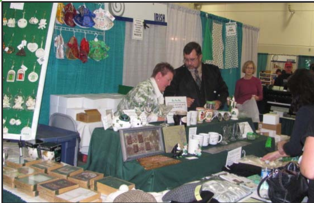
Retail Booth at the 2012 International Holiday Folk Fair