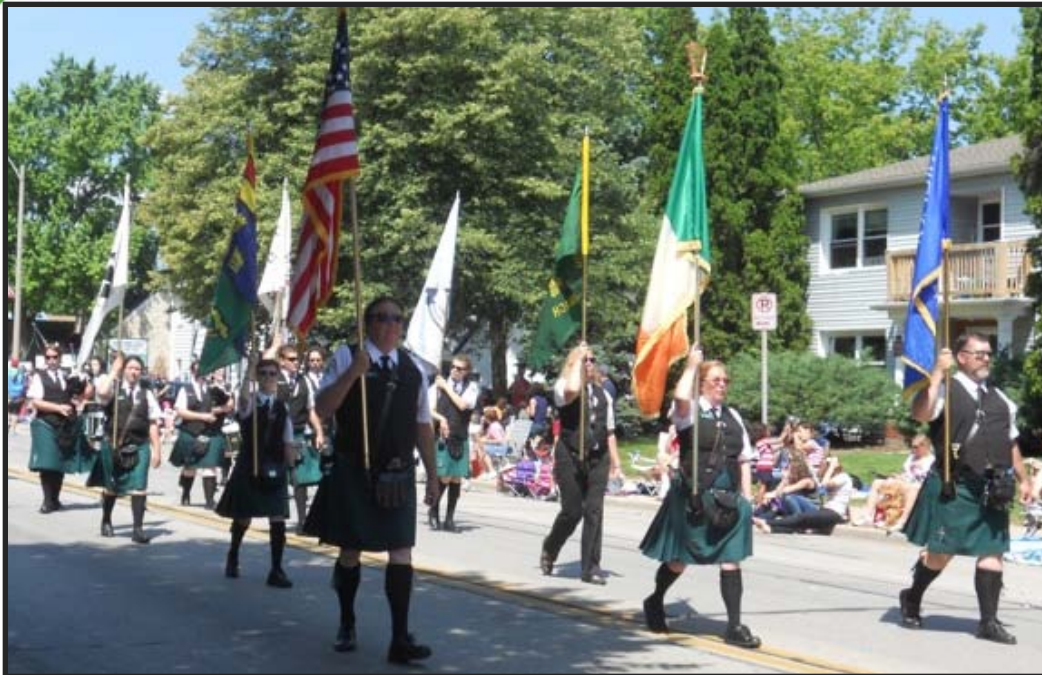
Shamrock Club Color Guard Pipes and Drums marching in the Wauwatosa July 4th Parade