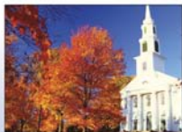
Autumn in New England