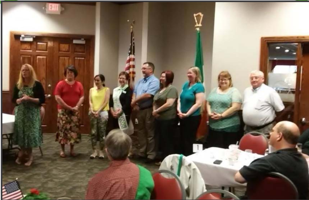
Shamrock Club 2015-16 Board is sworn in at the recent Installation Dinner.