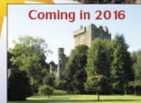
Coming in 2016 Ireland: A Celtic Jaunt