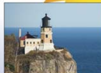
Lake Superior & the North Woods