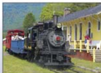
West Virginia Mountain Railroads